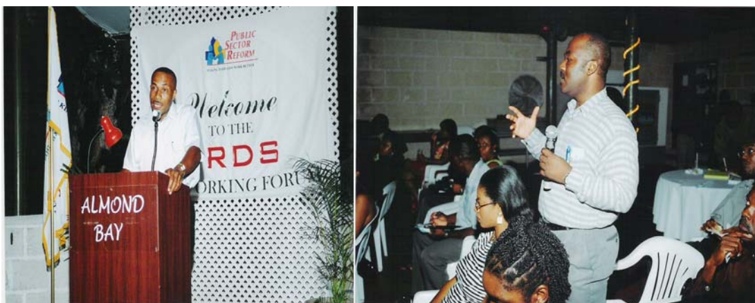
Some of the audience speakers giving their views on their PRDS

The Networking Forum was indeed timely, hosted just before the end of the PRDS annual reporting cycle, it enabled participants to renew energy and motivational levels as they approached a new cycle of reporting and planning. Several of the agencies participating in the pilot are at varying stages in the PRDS implementation continuum and as a result, many of the participants' experiences were varied. Nonetheless, feedback indicated that some experiences were common to all.