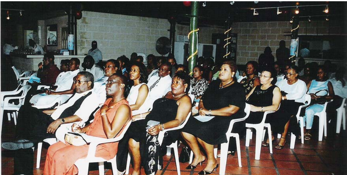
A cross section of persons attending the PRDS Networking Forum.

The Performance Review and Development System (PRDS) Unit in collaboration with the Office of Public Sector Reform recently hosted a Networking Forum under the theme: Sharing Experiences, Challenges and Solutions.